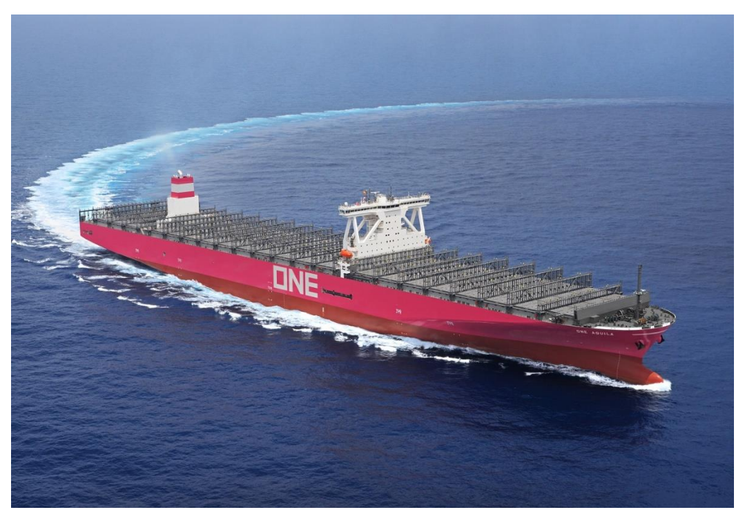
▲ONE AQUILA during the sea-trial.